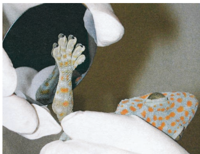
Fig. 2. Tokay gecko ( Gekko gekko ) adhering to molecularly smooth hydrophobic GaAs semiconductor. The strong adhesion between the hydrophobic surface of the gecko's toes and the hydrophobic GaAs surfaces demonstrates that the mechanism of adhesion in geckos is van der Waals force.

To account for the high degree of similarity in adhesive forces measured on surfaces with somewhat different polarizabilities, consider that when van der Waals interactions occur between